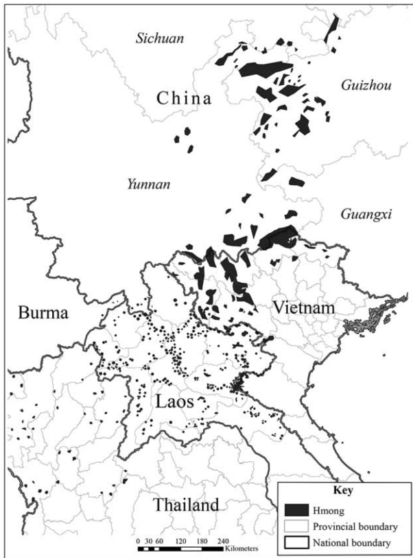
Figure 2. Approximate location of Hmong in Asia.

an educated guess suggests that of the 9.5 million Miao registered in the 2010 China national census (see table 1), about one-third self-identify as Hmong (Lee and Tapp 2010:1; Lemoine 2005).