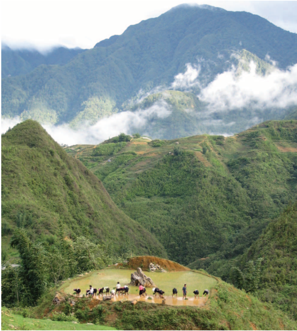
Figure 1. Hmong Leng wet-rice farming in a characteristic Zomian landscape. San Sả Hò Commune, Sa Pa District, Lào Cai Province, Vietnam, June 2010.

his book. First, who are the Hmong and why do they matter to the Zomia thesis? And what could the story of their writing systems tell us about their politics and aspirations? 3