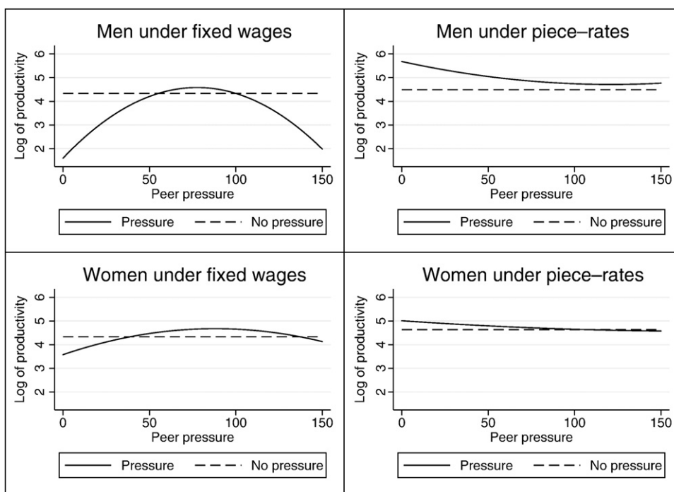
Fig. 4. Predicted log productivity of men and women under fixed wages and piece rates.

explanation for this effect is provided by theories of self-assessment and motivation (see Deci, 1975). There it is argued that a person's self-motivation can decrease with feelings of incompetence. Hence, a high signal about the productivity of another worker may decrease feelings of competence and result in the productivity decreases which are captured in our experiment. Such an effect appears to be more important for men than women.